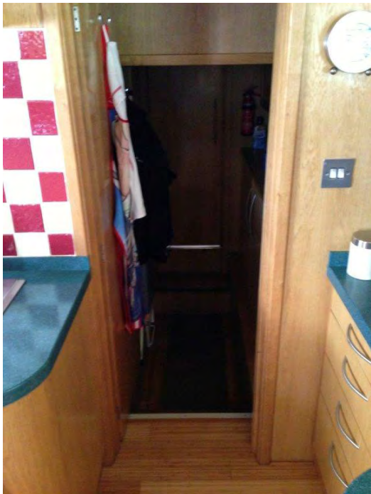
Passage to rear. Freezer and washing machine to right and engine room entry to left. Straight ahead to rear bedroom.