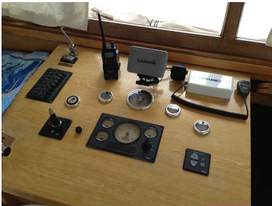
Original Wheel house instrument panel.