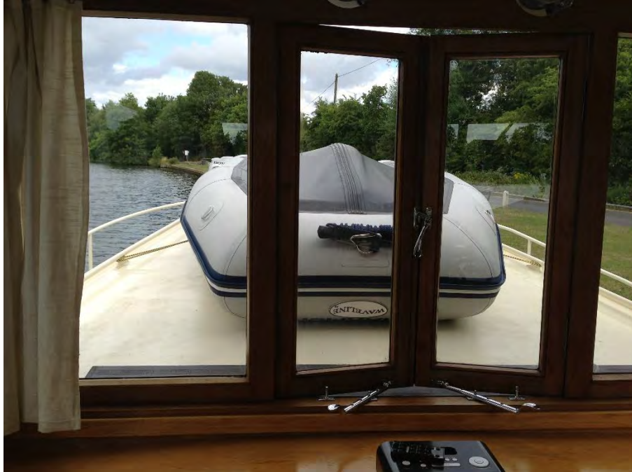
View to rear. Tender is included in sales price.